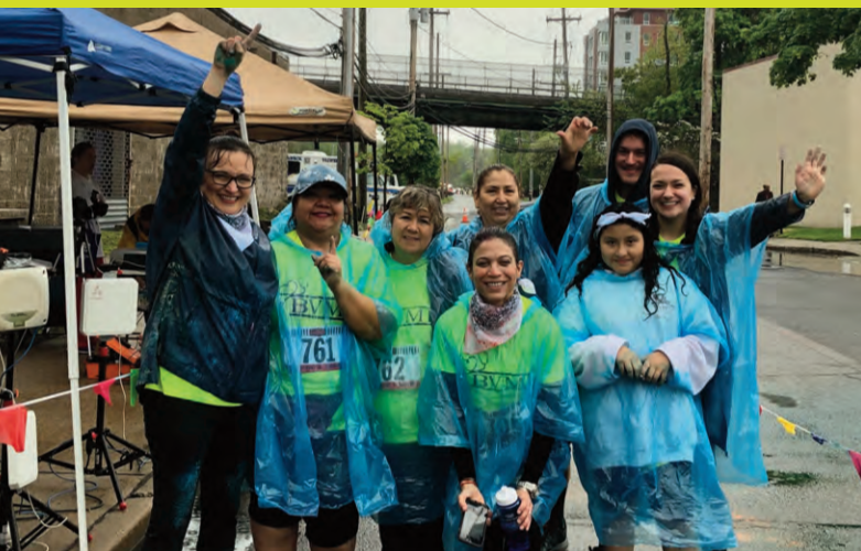
LEFT: Despite the cold and rain, participants in the PDP program crossed the finish line at the Teaneck 5K on May 5, 2019.